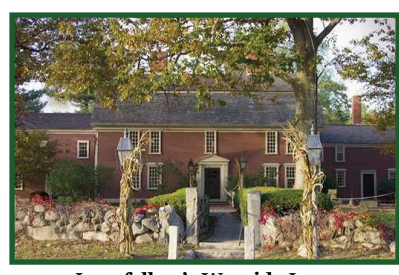
Longfellow's Wayside Inn

JANE's monthly meetings are on the fourth Wednesday of each month (except for November and December). January's meeting will be on Wednesday, January 27th, at Longfellow's Wayside Inn in Sudbury.