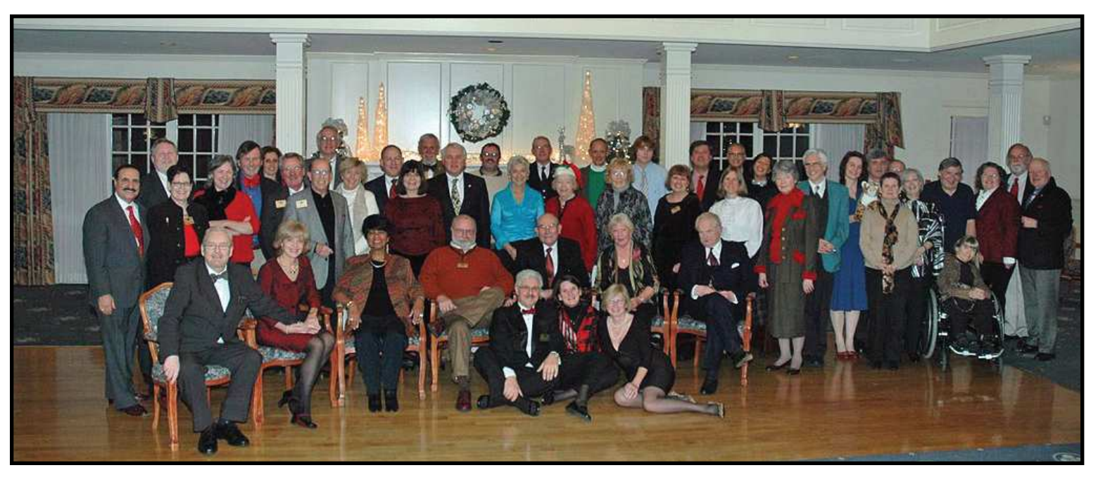
The entire gang at the JANE Holiday Party at Vesper Country Club